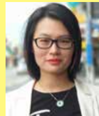
Crystal Pan Chinese Liaison